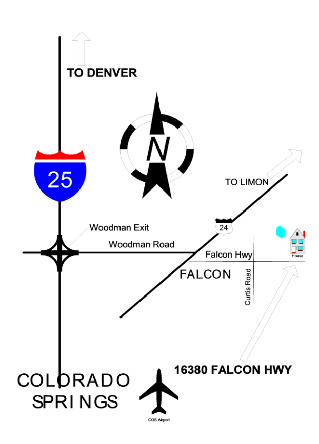
From I-25 North or South: Take Woodmen Road Exit and travel east to Highway 24. Turn Right on Highway 24 and then turn Left on Meridian. Go to stop sign and then Turn Left on Falcon Highway. Turn Left in driveway at 16380 Falcon Highway.